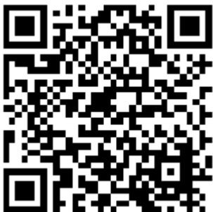
SCAN QR FOR PRODUCT PAGE